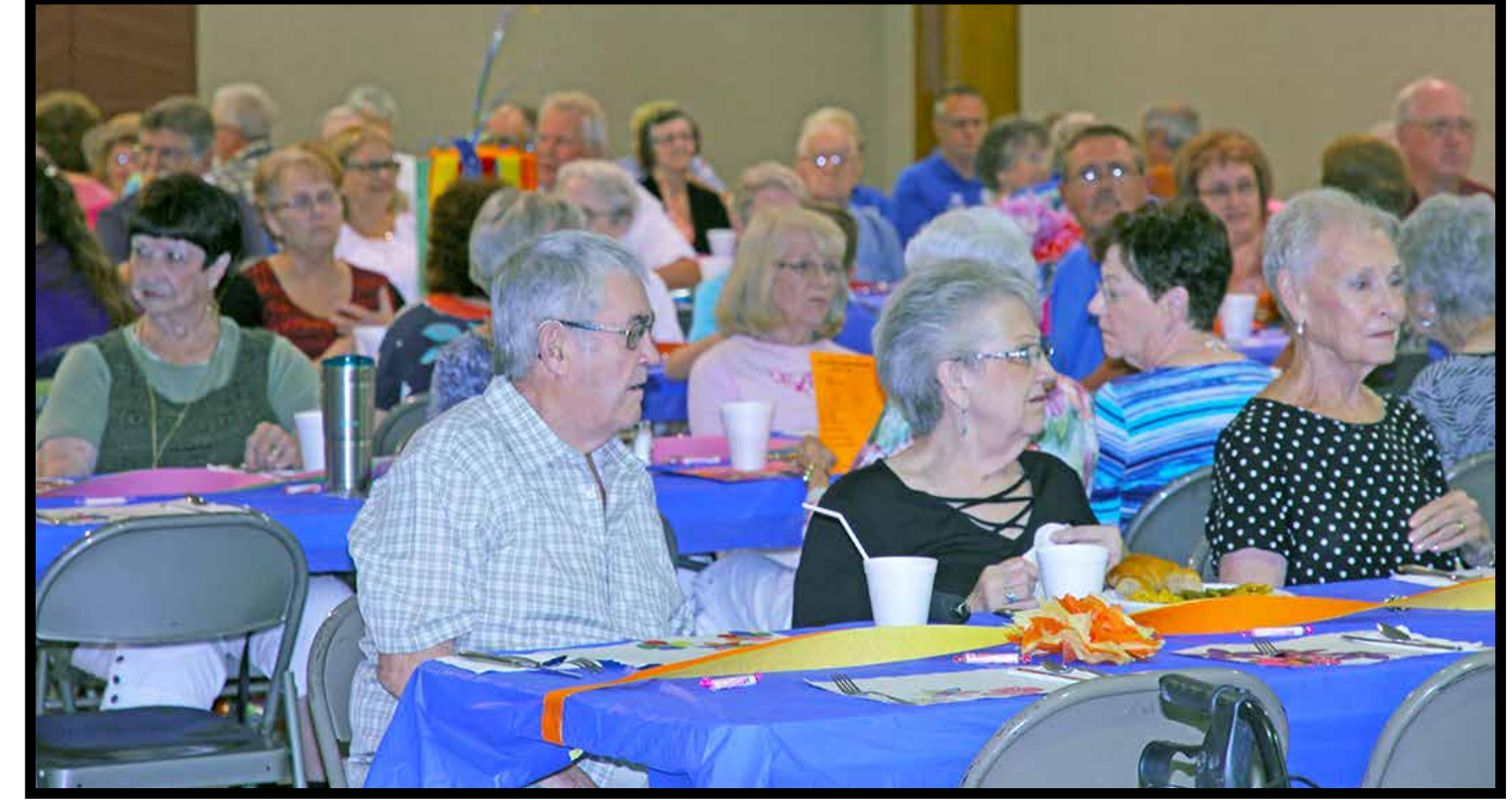
Approximately 170 people, including cancer survivors and helpers, were fed at Monday evening's Eighth Annual Clay County Cancer Crusaders' Survivor Dinner held at Flora's Community of Christ Church. Excellent Attendance For Weather Delayed 'Survivors' Dinner

Two Glitzy Girls will offer a 20% of their profits on the day of the Clay County Cancer Crusaders' Annual Event.